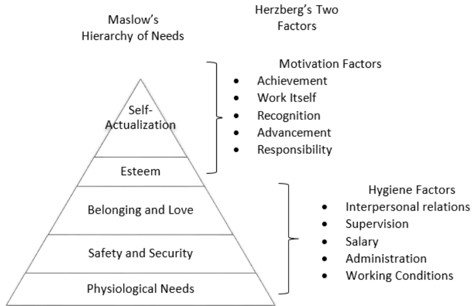
Figure 1. Herzberg's Two Factors and Maslow's Hierarchy of Needs