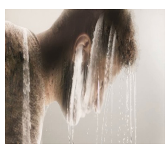
Theme 2: Forest as a Regulator