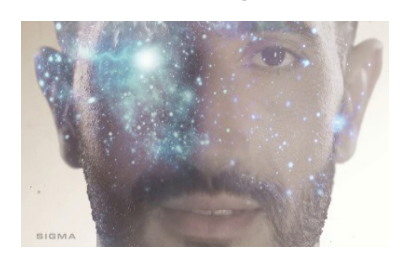
Theme 1: Prologue