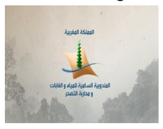
Theme 9: The logo

حميوني كيفما كنحميكم Protect me as I protect you